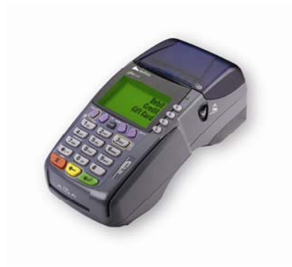
Omni 3750 Dual Comm