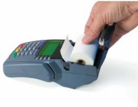
Omni 3750 -Paper Load